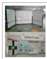
Knowledge Hub & Gallery