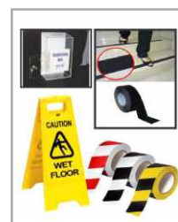
Good Practices Products