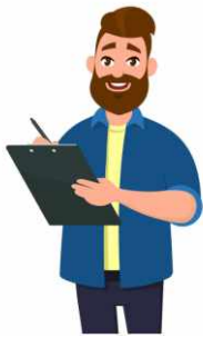
Visit / Survey