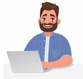
Plan & Design