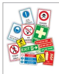
Signs & Signages