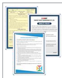
Policies & Instructions