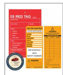
Tags & Labels